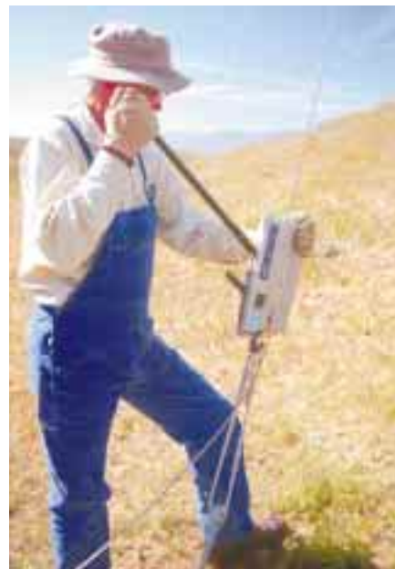
Below: Using the Super Pull-All to lower the tower. The cable passes through the body of the griphoist.

Electric winches are usually used here in the States to install the NRG towers for met masts. Installers typically power the winch with a truck battery. I didn't want our new truck in harm's way during my first attempt at raising an NRG tower. Of course, we could have lugged a battery up there to power the winch. But that didn't seem like a great idea either. Battery, winch motor, cables, connectors—seems like a lot of places for something to go wrong. With an 1100 pound (449 kg) load on the winch line, and a $2,000 BWC 850 at the end of a 64 foot