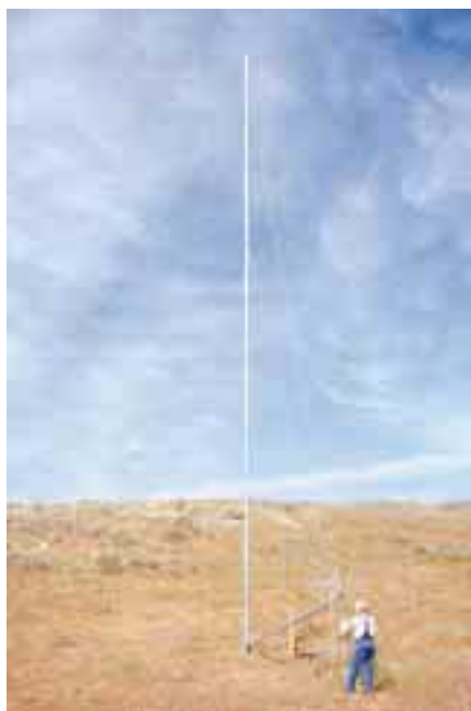
Above: Raising the tower the first time, without the wind turbine, using the griphoist.

Another facet of the communal approach to tower raising is often overlooked: you can quickly wear out your credit with friends and family. Communal tower raising is like Amish barn raising, bringing people together for a common purpose. But barns last indefinitely. You put it up and it stays up. Not so with a wind turbine. Whether we like it or not, small wind turbines do need repairs