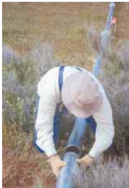
Above: NRG tower sections slip fit together and seat firmly when the tower is raised.

It's all of the above, and more. Tractel, the manufacturer, officially calls this hand winch a griphoist-tirfor-greifzug product. Griphoist