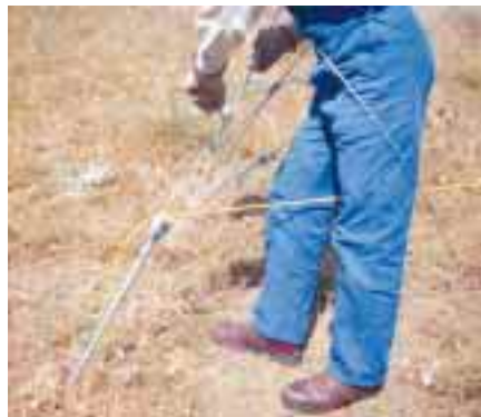
Above: Adjusting cable tension. The NRG tower system doesn't use turnbuckles which allows for quick adjustments under less than ideal site conditions.

the griphoist had safety keepers. You can never predict what may happen when you're raising a load; often there are some jerky movements despite your best efforts. Safety keepers or latches keep the hooks engaged when there's unintended slack in the cable. NRG's Blittersdorf as well as our local Tractel reps offered to replace the stamped metal hooks with hooks using keepers, but I wanted to test the griphoist right out of the box, so we sent it back.