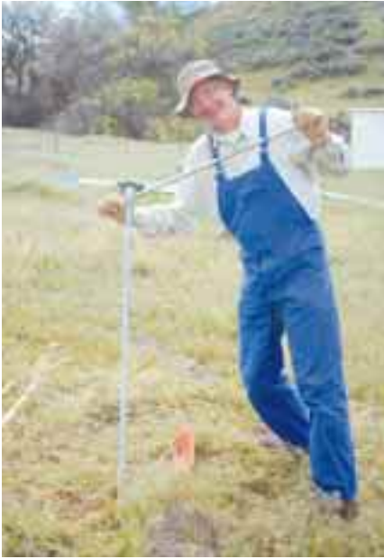
Above: The screw anchors can be driven by hand.

turbines on hinged towers. So when I began planning to install our own BWC 850, I naturally thought of using one myself.