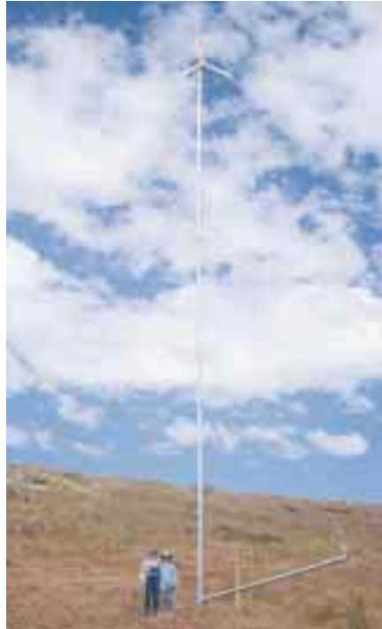
Above: The new American Gothic. The griphoist allowed us to slowly and safely raise our BWC 850 on a difficult hillside site.

Unlike traditional towers with anchors at exact positions relative to the tower, the NRG system was designed for quick installation under field conditions. The guy cables are tensioned by hand. As the tower is raised and lowered, the guy cables may need adjusting. This system can't use pre-formed wire grips or