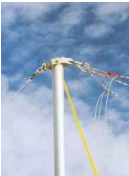
Above: The gin pole bracket showing the hoisting cable (left), nylon rope for steadying, and three lifting guys to tower (right).