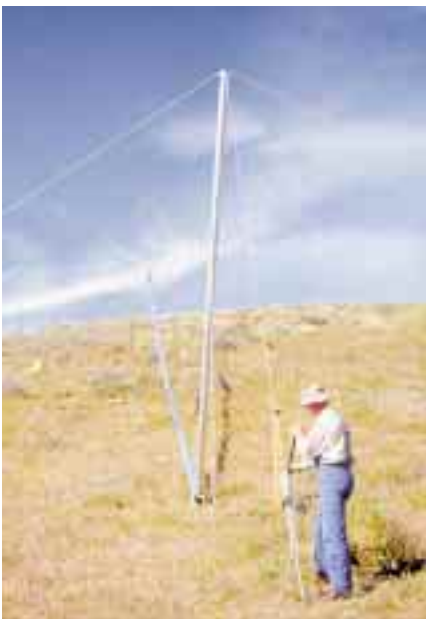
Below: The tower almost down. The forward lever on the griphoist is used to pay out cable.

You could call the Pull-All an entry-level griphoist. It was inexpensive and it would have done the job except for one serious drawback: neither the hook on the hoisting cable nor the hook on the body of