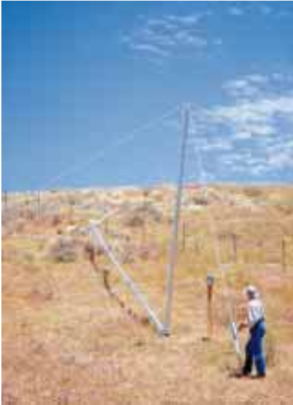
Above: Raising the tower again, this time with the Bergey 850, takes some effort. Going slow allows time for double checking.

hoist or the hoisting tackle must be anchored directly below the gin pole when the tower is fully upright. The twenty foot long gin pole is comprised of two ten-foot sections. If the hoisting anchor is farther than the length of the gin pole from the tower base, the sections could come apart, endangering the lift. NRG provides a safety cable to prevent this from happening, but no one wants to tempt fate.