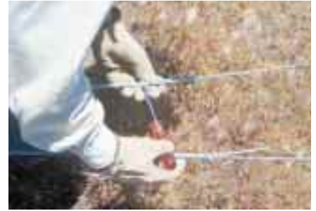
Above: Tightening wire rope clips. Remember, "Never saddle a dead horse."

Like come-alongs, griphoists can "float" between the load and the anchor for the hoist. Electric winches and hand-cranked mechanical winches are all intended to be