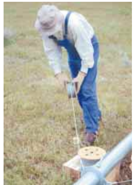
Below: Unreeling the guy cables. All attachments to the guy bracket are swaged, simplifying assembly.

Using a vehicle for tower raising is just too risky for me. I've used a truck with block and tackle to salvage wind machines back in the 70s and I had one or two near misses that I've never forgotten. And I've installed Bergey 1000s on guyed towers in Pennsylvania using a truck and gin pole. It was always, shall we say, exciting. The NRG tower looks like a long strand of steel spaghetti. Raising it with the jerky motions common to a vehicle-driven lift seems like a recipe for disaster.