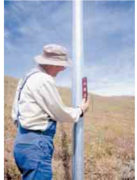
Above: Checking the tower for plumb. The turbine will only yaw properly on a plumb tower.

cake. Then we slowly raised the tower, inch by inch. While I operated the griphoist, Nancy kept tension in the rear guy cable with a tag line, standing well clear of the fall zone.